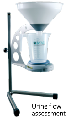
Urine flow assessment

Your doctor will discuss treatment options suitable for you.